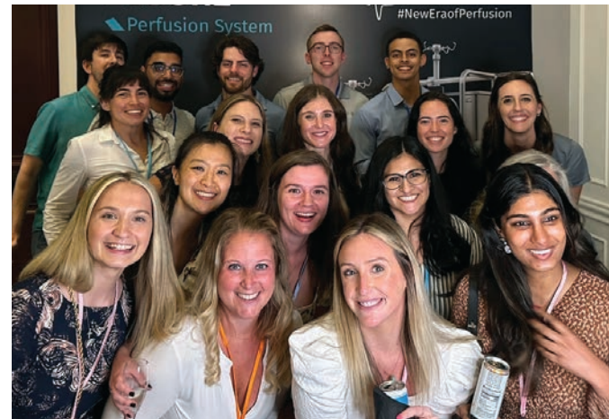
RUSH perfusion students and faculty had a strong presence at the 2023 Sanibel Symposium.

Many RUSH perfusion students also present at national and local conferences, where they have an opportunity to build their communication and networking skills, Collins says.